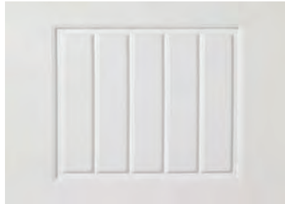
V5 panel (Model 872)