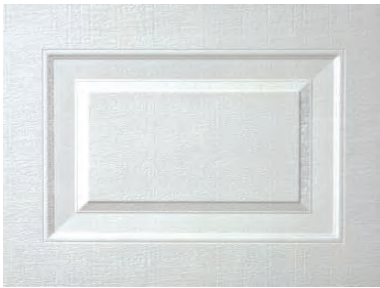
Standard panel (Model 870)