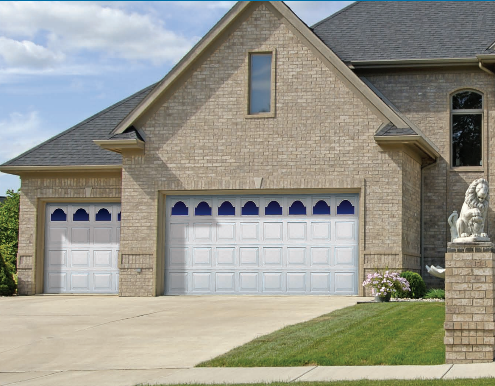
Image above: Standard Panel, white finish, Cathedral windows Front image: V5 Panel, Monterey Sand finish, Stockton windows

With their rugged, thick vinyl skin, the Durafirm Collection™ doors are the ideal escape from wood door maintenance and steel door dent and rust worries.