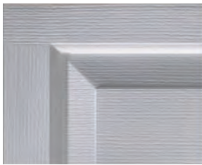
Cape Cod Gray