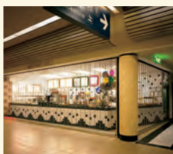
Rolling & Side Folding Security Grilles & Closures