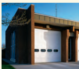
Thermacore® Sectional Doors