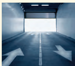
Advanced Rolling Steel Door RapidSlat®